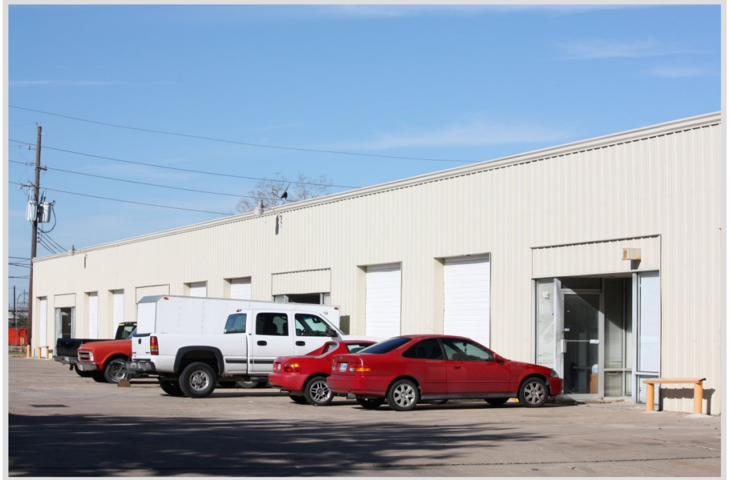
Grade Level Overhead Doors